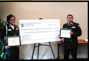
2009 Scholarship Ceremony