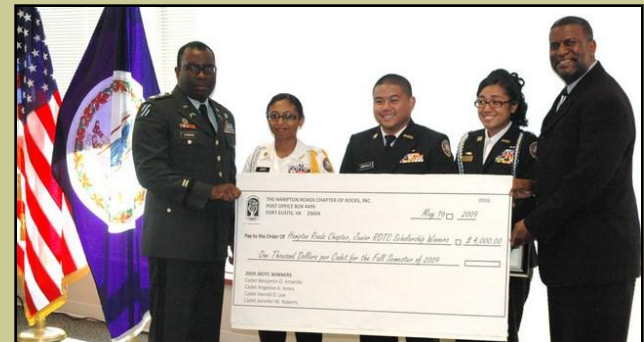
President, Scholarship Recipients, 2009 Chairperson