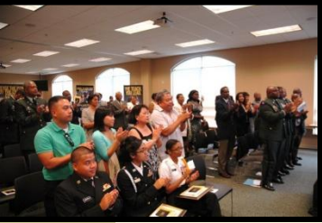
2009 Scholarship Ceremony

The HRC Rocks will choose winners from the seven cities that make up the Hampton Roads Region. Students may chose to attend any college with an ROTC program.