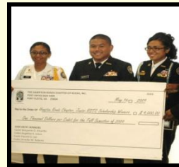
2009 Scholarship Winners

Hampton Roads Chapter of the ROCKS, Inc. P.O. Box 4499 Fort Eustis, VA 23604