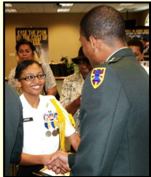
2009 Scholarship Ceremony

Hampton Roads Chapter of the ROCKS, Inc. P.O. Box 4499 Fort Eustis, VA 23604